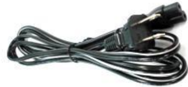
Power Cable (CE, US, UK Type – Choose 1)