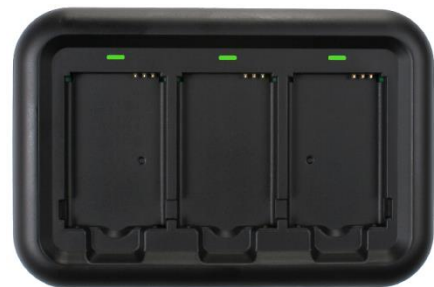
Battery Multi Charger (3 Slots)