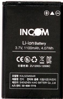
Lithium ion Battery