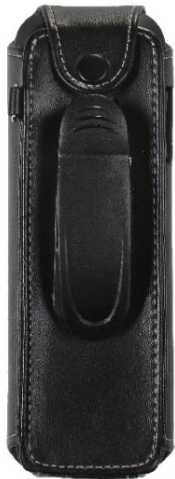
Synthetic Leather Case